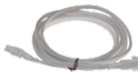
Water leak extension 2 m